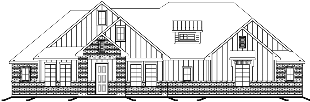
FRONT ELEVATION "B"