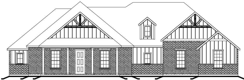
FRONT ELEVATION "A"