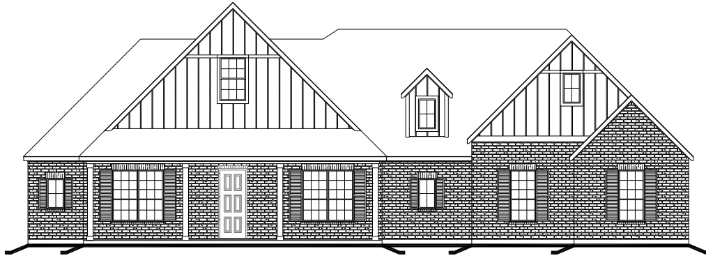
FRONT ELEVATION "A"